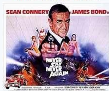
British cinema poster by Renato Casaro